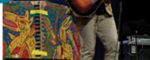
Kathy Mattea, Drew Holcomb & the Neighbors

Mountain Stage has been the home of live music on public radio for 40 years. Each two-hour episode, produced by West Virginia Public Broadcasting, hosted by West Virginia native and Grammy Award-winner Kathy Mattea and distributed by NPR Music, can be heard weekly on more than 280 stations across America and around the world. Mountain Stage features performances from seasoned legends and emerging stars in genres ranging from folk, blues and country to indie rock, synth pop, world music, alternative and beyond. Each episode is recorded before a live audience and typically features performances by five artists. “Music and hospitality – that’s what it’s all about,” Mattea told Rolling Stone in a recent interview. “And those two things? That’s West Virginia right there.”