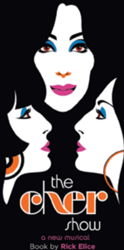
Illustration: © 2014 Big League Productions, Inc. All rights reserved.